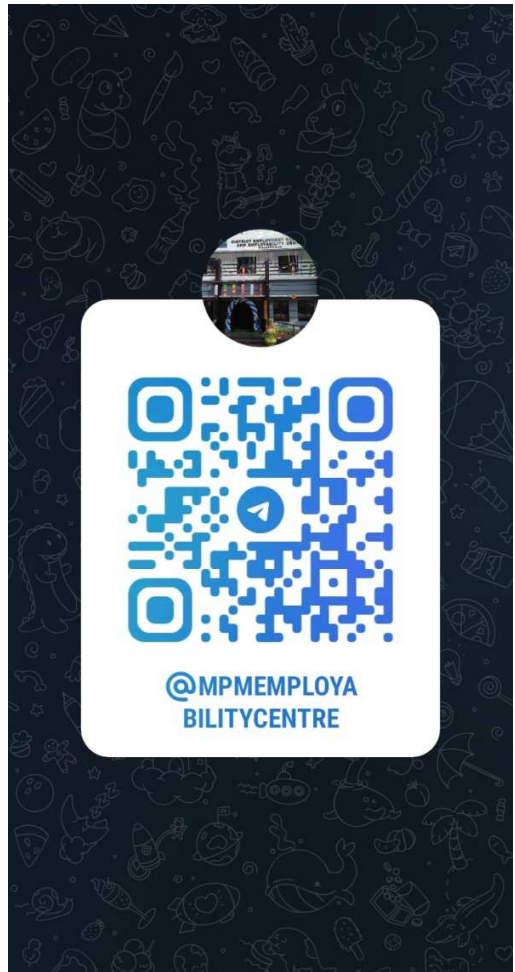
EMPLOYABILITY CENTRE TELEGRAM CHANNEL