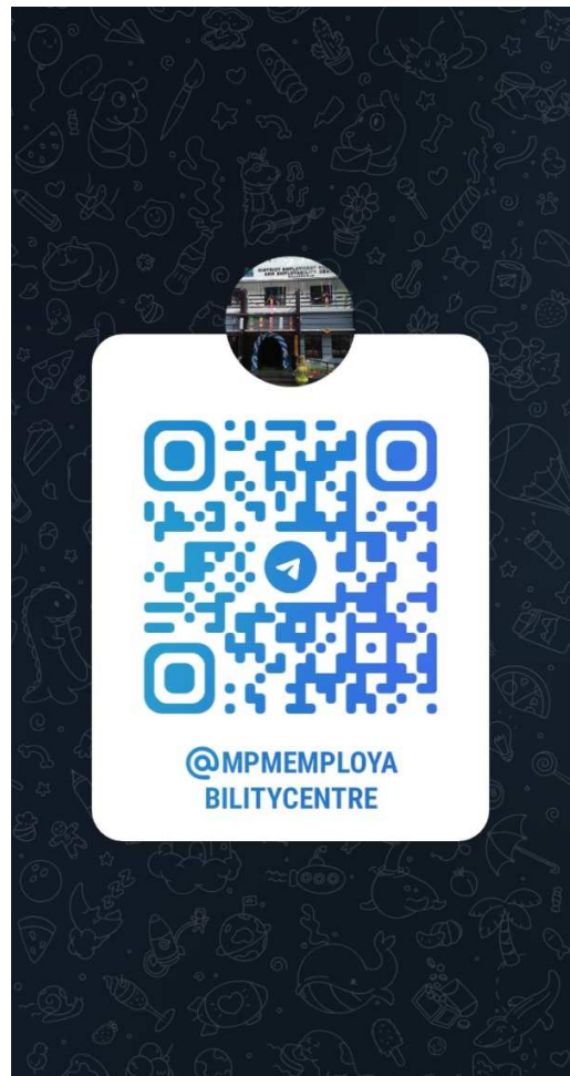
EMPLOYABILITY CENTRE TELEGRAM CHANNEL